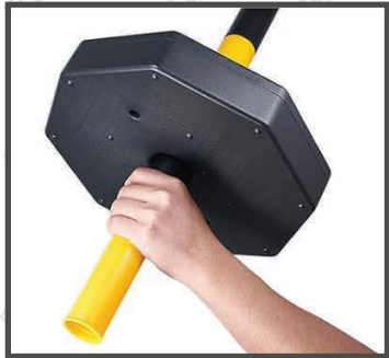
Insert From The Bottom