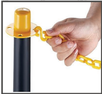
Connect The Cap And Plastic Chain