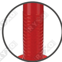
THREADED DESIGN Increase resilience and durability