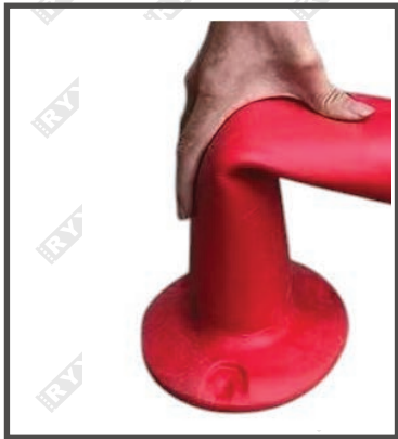
REFLECTIVE BAND Caution & Guide Traffic

Flexible and anti-bending EVA compressive flexible material Automatic spring back after bending