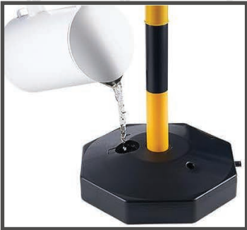
Inject Water Or Sand To The Base