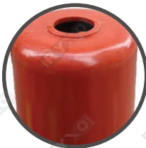
HEAVY DUTY PU Sturdy & Durable / Weather resistant