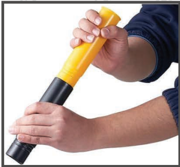
Assemble The Tubes Together